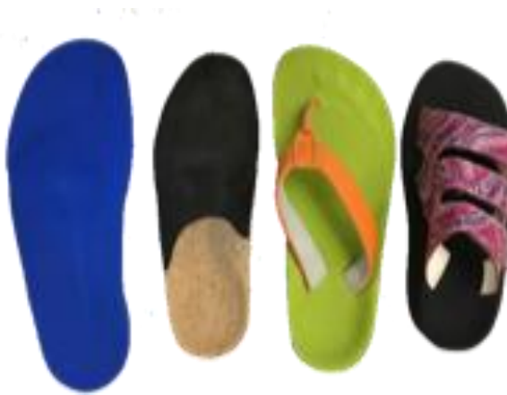
Examples of Sandal design

Our custom made sandals are made from a 3D scan of the patients feet. Using our advanced software, we can modify the sandal to treat most of the common foot disorders. The sandals comes in many different designs and fashions.