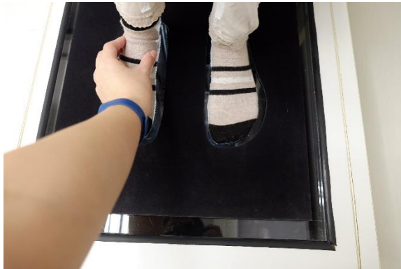
3D foot scanning process