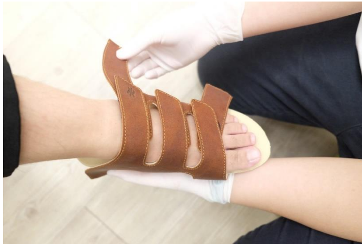
Fitting sandal straps

2. The Second visit: It is usually 2-4 days after the first visit and will take approximately 45 minutes to 1 hour for insoles fitting and 3-4 hours for custom sandal fitting. Now the insole or sandal is ready to be fitted for the patient. Insole patients will need to bring the shoes into which the insole is to be fitted so that the insoles can be perfectly adjusted. To finalize the sandals we will adjust and fit the upper leather chosen. It is important that the upper leather fits perfect in each case so that the sandal can be worn comfortably. Once the upper leather is fitted, we will glue on the high quality rubber sole.